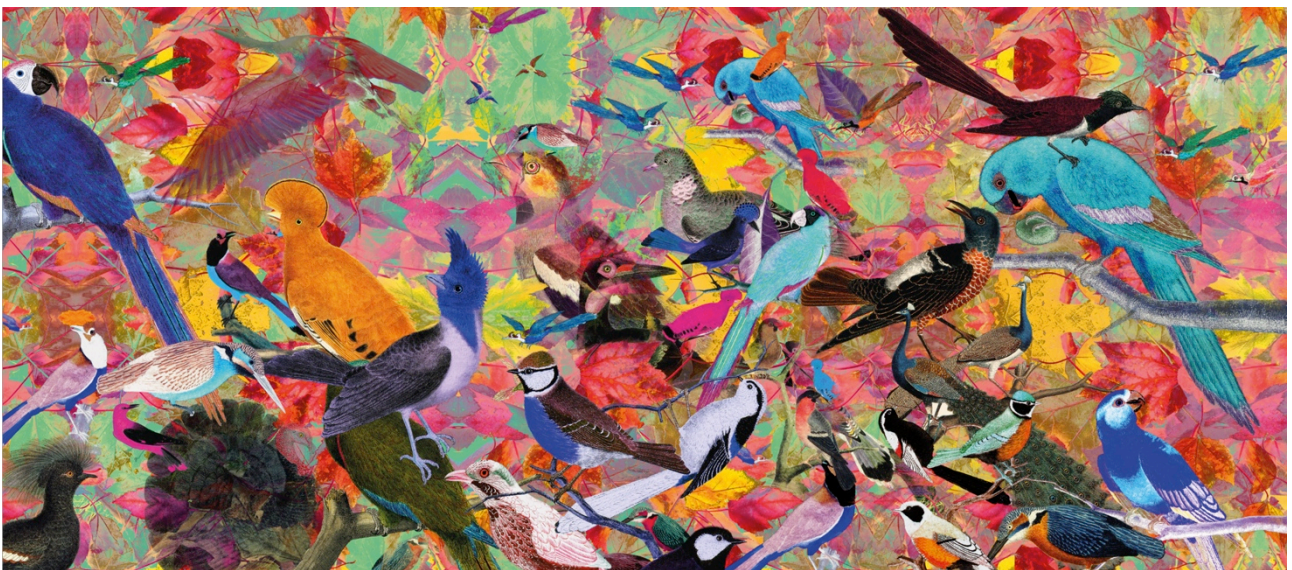
SECRET JUNGLE III, Archival print on paper, Limited edition of 20, 40 x 100cm, 2014

Then, he cuts the birds elements, retouching the selected found objects with his stylish colorful sense into the “jungle background”. Considering the “jungle aesthetics”, the pure colors are mainly composed in the series.