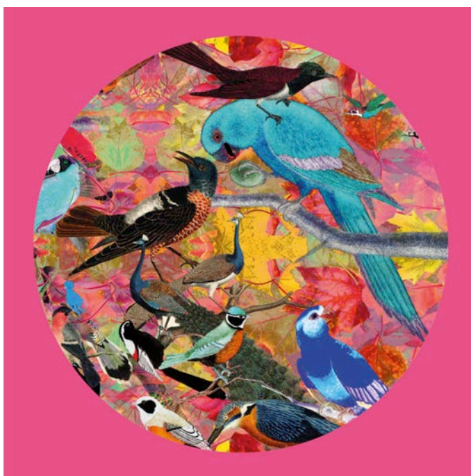
SECRET JUNGLE II, Archival print on paper, Limited edition of 20, 40 x 40cm, 2014