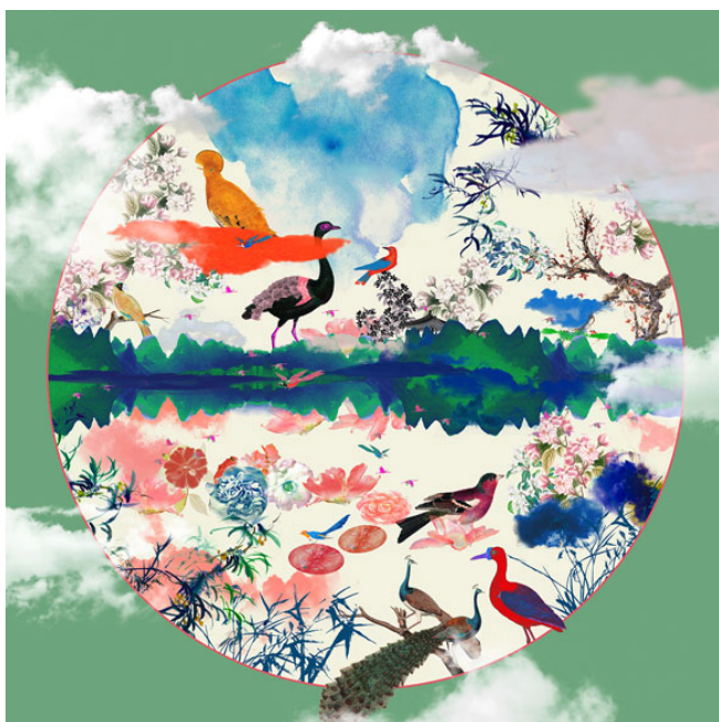
MOON II, 2015 Paper size 90 x 90cm Digital Print on Hahnemuhle Smooth Fine Art Paper, Photo Rag 305gsm Edition of 5